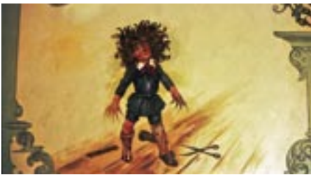
"Tangle-Haired Peter" – fresco painted by Davood Roostaei in the Villa Höltigbaum (on page 48)