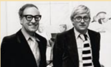
... David Hockney