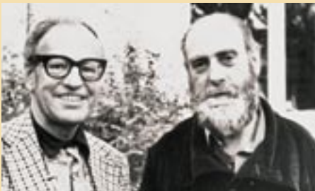
... Friedrich Stowasser (Hundertwasser)