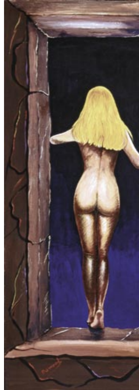
"Mirror in a Mirror"