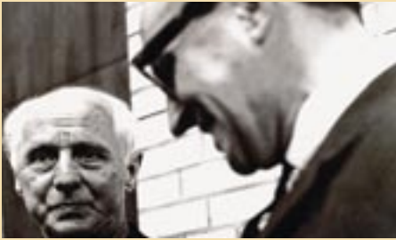
... Max Ernst