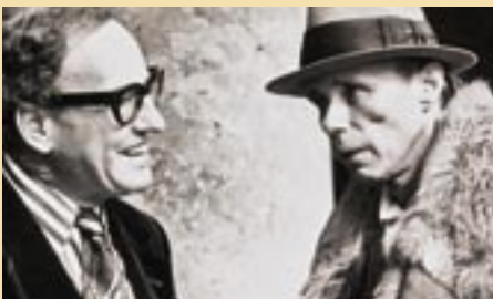
... Joseph Beuys