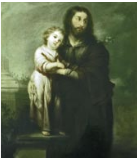
Restored picture in the Villa Höltigbaum (on page 49)