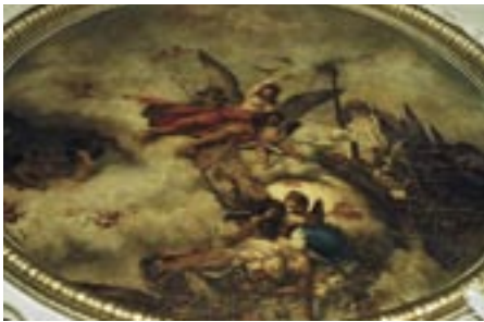
"Allegory" a painting which Davood Roostaei created in the Villa Höltigbaum based on historical examples (on page 46)